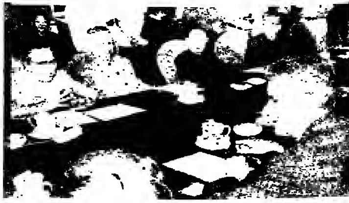
TALKS OPEN -- U.S. Secretary of State Cyrus Vance (right) opens talks with Chinese Foreign Minister Huang Hua (left) in Peking Monday.

In Pretoria yesterday, Mr. Botha said his government had told the United States and other countries that Soviet charges that South Africa was about to test a nuclear weapon were "wholly and totally unfounded."